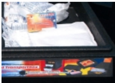
CellaLog in a refrigerator chest

The temperature data logger „CellaLog ® „ makes this a problem of the past: a processor with a temperature sensor, contained within an enclosure the size of a credit card, 4 mm thick and 30 g light, developed by Keller HCW GmbH in Ibbenbüren, Germany. CellaLog ® can easily accompany the goods during transportation, usually indiscernible to the shipper.