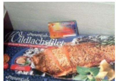
CellaLog within a freezer

Aside from the shipping business, CellaLog ® can be used for a wide variety of stationary applications such as within refrigerator or freezer chambers.