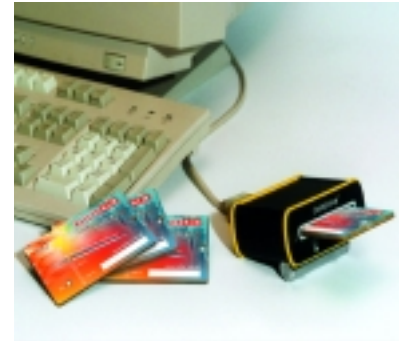
CellaLog with reading device CellaDrive

The „CellaDrive“ reading device is a tool for downloading the recorded measurement data to a PC. CellaLog is simply inserted into the reading device which is connected to the serial interface of a PC. The temperature values including date and time can be viewed at a PC for further analysis.