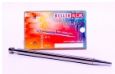
CellaLog with LED and CellaLogPen

Once the transported goods have arrived, the receiver can establish what has occurred in regard to temperature. For a quick on-the-spot check the „CellaPen“—magnetic pen can be briefly held to the card.