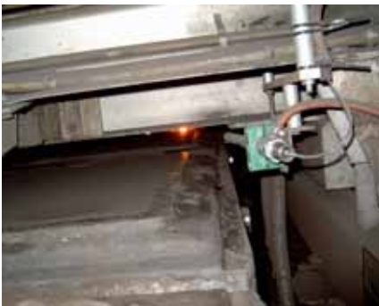
Fibre optic measurement in cramped conditions

Two-colour pyrometers – due to their extremely precise, high-resolution optics – are the best choice for continuous measurement of the molten metal within the transfer channel. There the ambient conditions often dictate that a pyrometer be installed at a considerable distance – sometimes up to 10 m away – from the molten stream. The system's algorithms ignore any surface slag and oxidation.