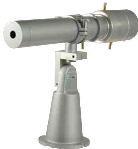
Pyrometer assembly including cooling jacket, air purge, protection and mounting accessories

In summary, CellaCast® provides producers of steel and iron products an absolutely modern, nonwearing temperature monitoring system, resulting in cost savings because expendable thermocouples are not needed. Because the temperature monitoring system is automated, it does not require personnel to be engaged in the task of measuring. Operator-caused measurement errors cannot occur. The temperature of the molten mass is continuously monitored within the casting channel or at the molten stream to verify and document quality control of the process.