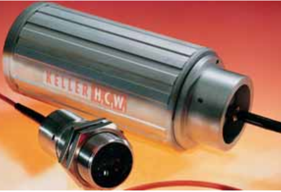
Pyrometer with Fibre Optic Cable

Two-colour pyrometers – due to their extremely precise, high-resolution optics – are the best choice for continuous measurement of the molten metal within the transfer channel. There the ambient conditions often dictate that a pyrometer be installed at a considerable distance – sometimes up to 10 m away – from the molten stream. The system's algorithms ignore any surface slag and oxidation.