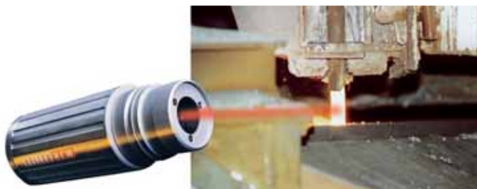
Temperature measurement of the pour stream

Due to the problems arising from the immersion method, KELLER HCW has developed an innovative system named CellaCast® for non-contact temperature measurement using a pyrometer. The pyrometer detects the infrared radiation emitted by the molten mass and converts it into a signal which is proportional to temperature. Pyrometers do not have any wearing parts, thus no operating expenses are generated due to materials requiring frequent replacement. The financial payback of this instrument comes in the form of greatly reduced thermocouple consumption.